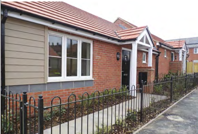
New housing Development, Midland Road Eastwood.

The Council is committed to providing new and affordable homes across Broxtowe Borough. To find out more visit www.broxtowe.gov.uk/housing