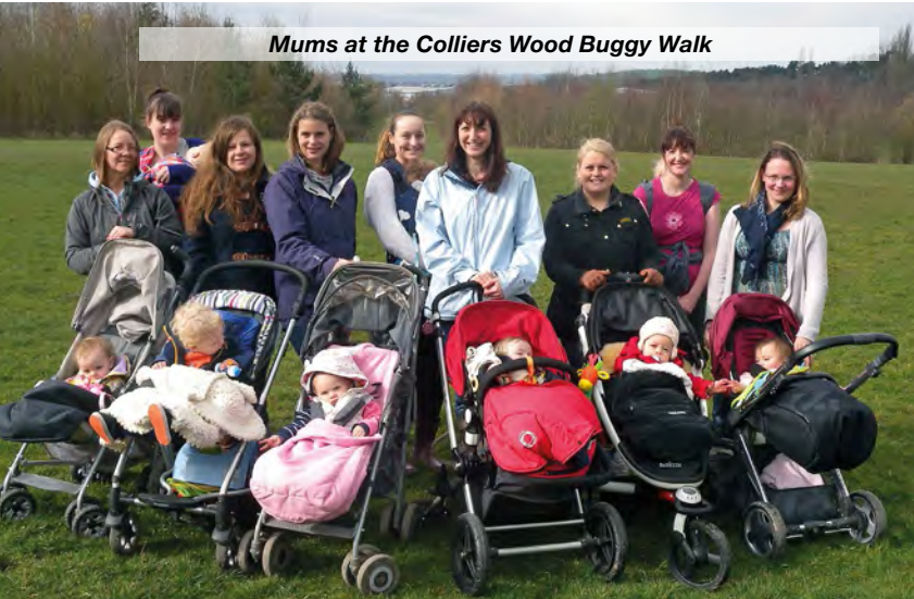
Mums at the Colliers Wood Buggy Walk

A new season of free Buggy Walks will help new mums keep fit and make friends this spring and summer in two of the borough's picturesque nature reserves.