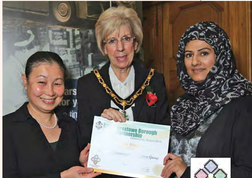
Members of the Broxtowe Community Celebration Group accept their Broxtowe Partnership Award from Mayor of the Borough of Broxtowe 2013/14, Councillor Iris White.