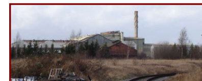
Stanton Ironworks, South Ilkeston