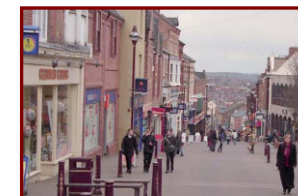
Ilkeston Town Centre