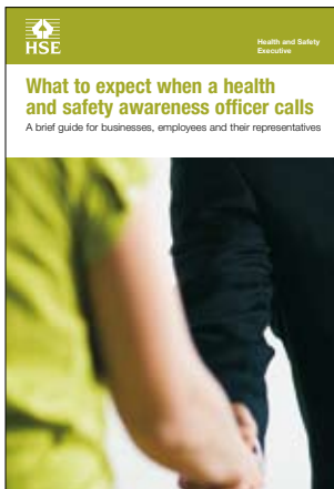
This is a web-friendly version of leaflet WCOVL100

A brief guide for businesses, employees and their representatives