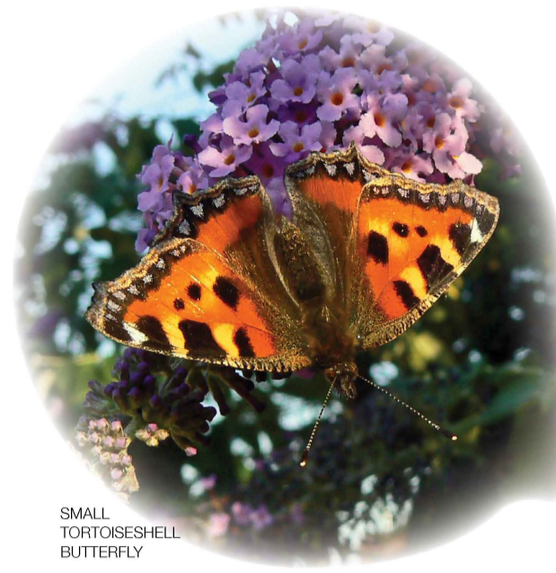
SMALL TORTOISESHELL BUTTERFLY