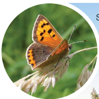
SMALL COPPER BUTTERFLY

The site is owned by Broxtowe Borough Council and is managed in partnership with the BTCV, the Friends of Bramcote Ridge, the Nottingham Wildlife Trust and the Bramcote and Stapleford Hills Public Open Space Forum.