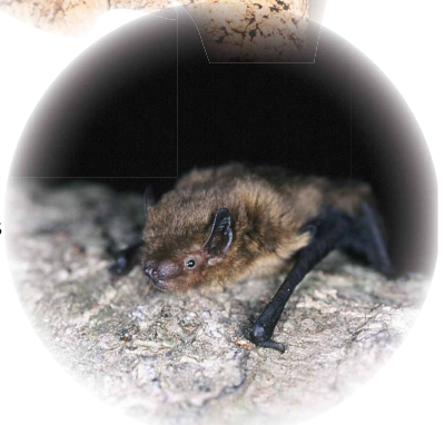
SOPRANO PIPISTRELLE BAT