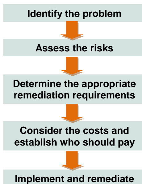
Figure 1.1 Principles of the Part 2A regime

Part 2A provides the regulatory framework for the identification and remediation of Contaminated Land. The regime is based on the following basic principles: -