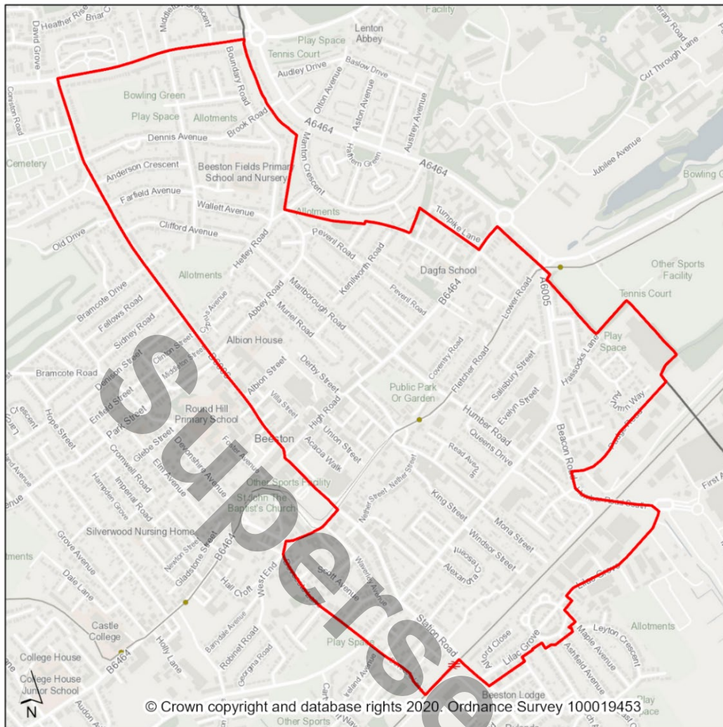
Figure 1: Area covered by Article 4

1.1.3 HMOs are a significant part of the housing mix within Broxtowe Borough. The Council recognises their important role for providing accommodation to a range of individuals and there are also many property owners who wish to contribute to meeting the demand for HMOs. However, as with other types of development, an over concentration of a single type of dwelling may cause harm to an area and can make it difficult to create a sense of community cohesion, and as stated within the ‘justification’ text of Policy 8 of the Aligned Core Strategy, the increased numbers of student households and Houses in Multiple Occupation (HMOs) has altered the residential profile of some neighbourhoods dramatically, and has led to unsustainable communities and associated amenity issues.